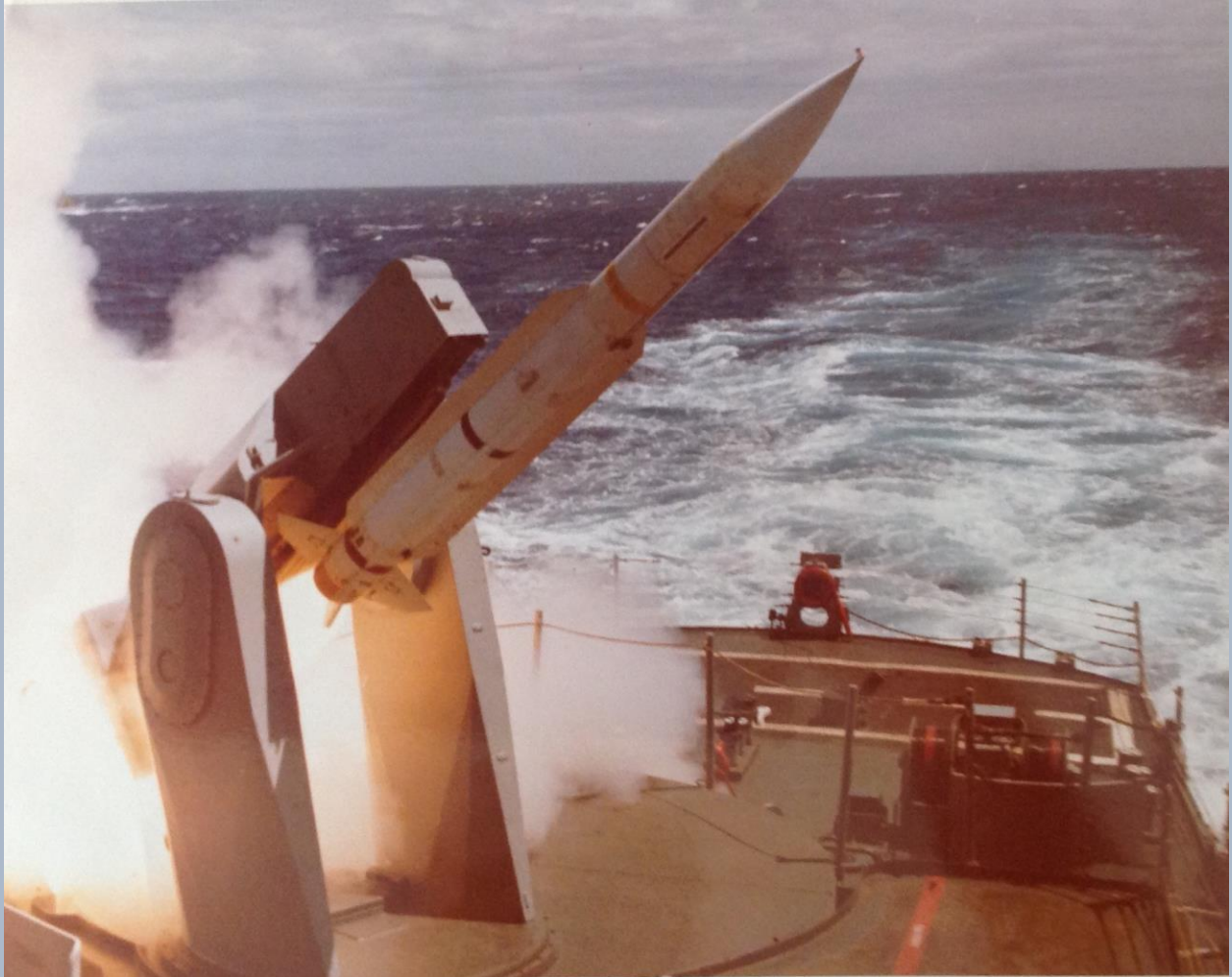
This was taken in '78 during exercises off the coast of Kauai, about 100 miles west of Pearl Harbor. It was taken by one of the missile techs and he sold them to us for $7 each (glossy 8x10)