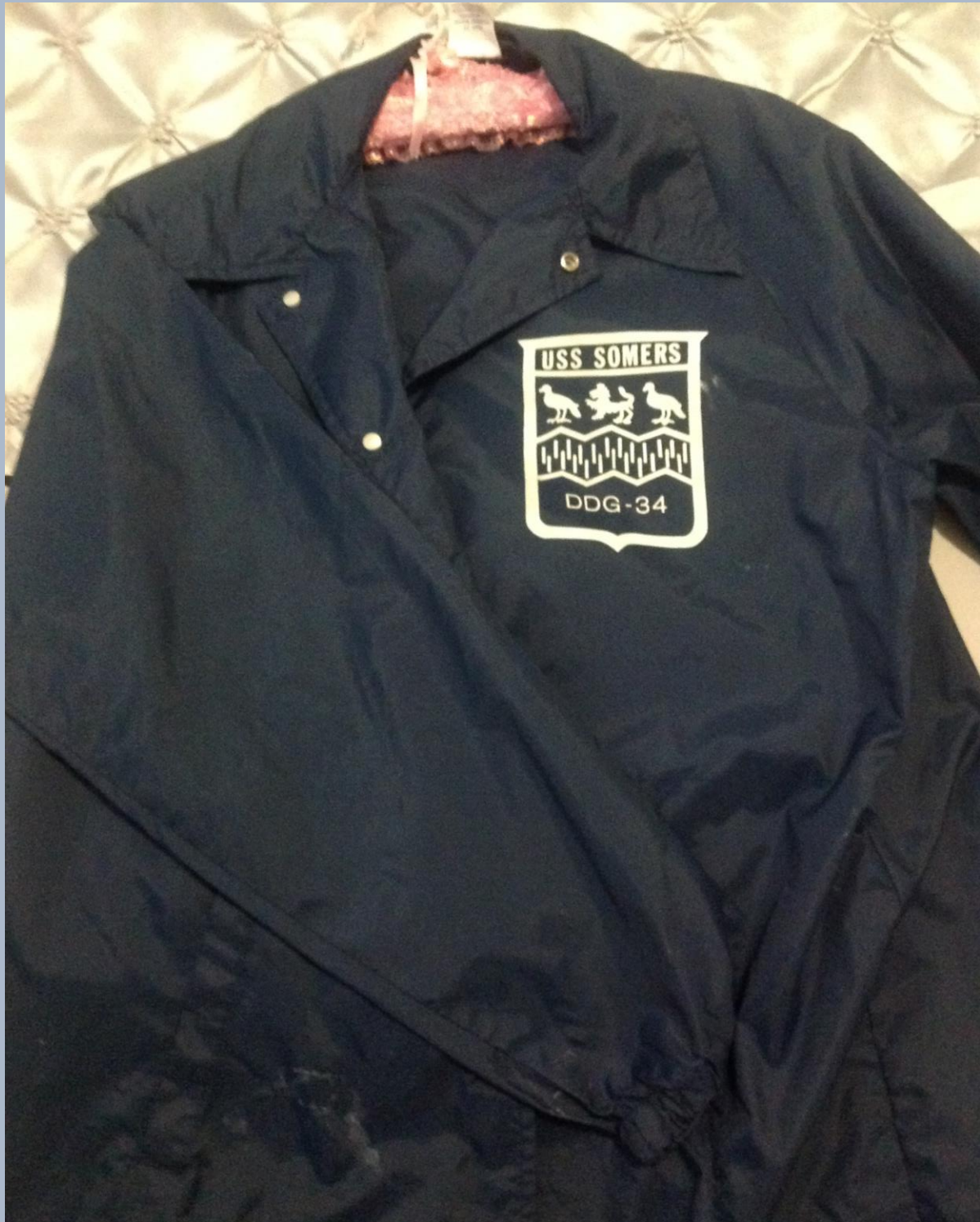
One of the few mementos that I still have from my time on the Somers. A parka that was sold in the ships store during our WESTPAC '77 Cruise.